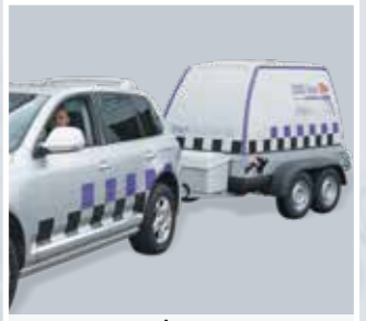
easy to move